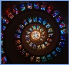
Showing the way to God