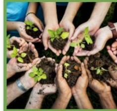
Caring for our Common Home