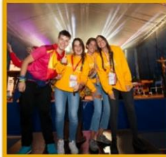
Journeying with Youth