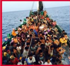
Walking with the Excluded